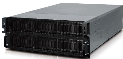
Front Access 48 x 2.5" HDD or 24 x 3.5" HDD