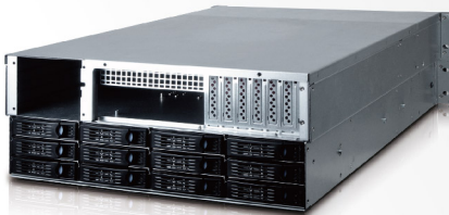
Rear Access 24 x 2.5" HDD or 12 x 3.5" HDD